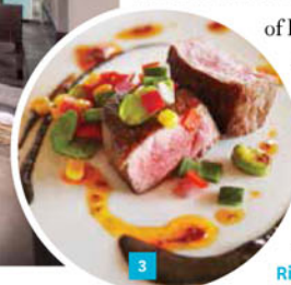
1 The outdoor lounge area of the penthouse at the new Nizuc Resort & Spa on the Riviera Maya. 2 The infinity pool at Nizuc, where individual cabanas offer an unparalleled view of the resort's two private beaches and the Mesoamerican Barrier Reef, the second largest coral reef in the world. 3 The beef tenderloin steak at La Marea, the Mexican-Mediterranean restaurant at the Viceroy Riviera Maya.