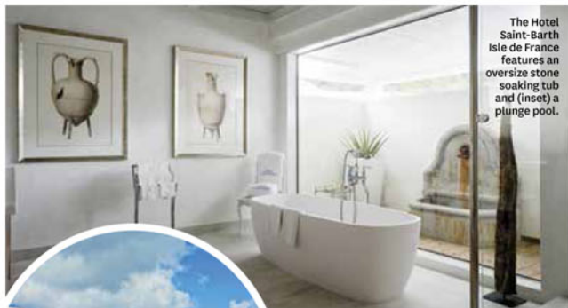
The Hotel Saint-Barth Isle de France features an oversize stone soaking tub and (inset) a plunge pool.