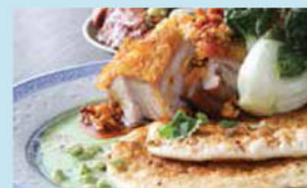
Soy milk pancakes with smoked pork, leek flower sauce and pickled mustard greens at Blackbrick.

With Jeffrey Deitch ’s annual event gone since he shuttered his namesake gallery in New York (long before resigning from the MOCA board in July), MoMA’s PS1 shindig at the reinvigorated Delano on Dec. 6 may win party primacy this year.