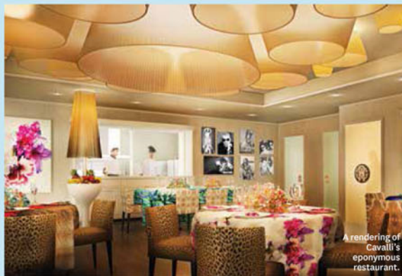
A rendering of Cavalli’s eponymous restaurant.