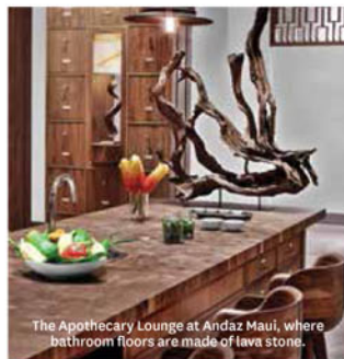
The Apothecary Lounge at Andaz Maui, where bathroom floors are made of lava stone.