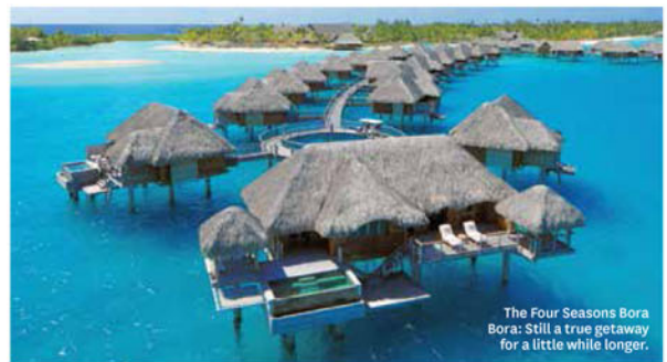
The Four Seasons Bora Bora: Still a true getaway for a little while longer.

24-room Lumeria Maui , where Marcia Gay Harden and Elysium executive producer Bill Block have vacationed, stays include daily yoga and meditation (from $329 in 2014). Montage Hotels took over the Ritz Carlton Residences at Kapalua Bay and will open Montage Kapalua Bay in early 2014. The 24-acre property will offer 50 suites with 56 residences for sale, a 30,000-square-foot spa and a multitiered lagoon pool cascading through the resort. — J.J.